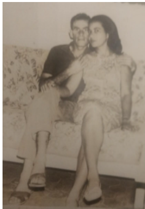
In 1969 – Dad and Mom